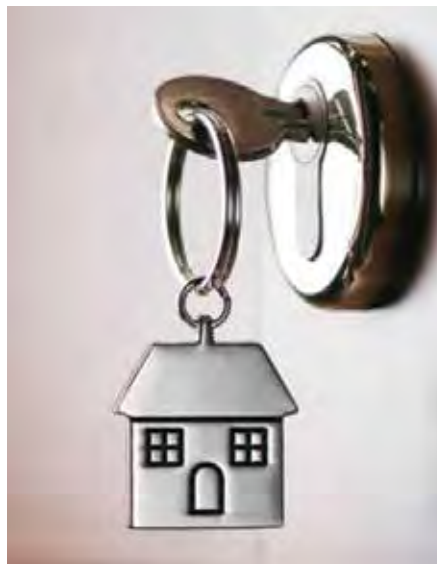
Always keep your keys in the door.

Go to a neighbour – get them to call 111